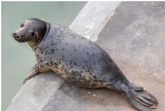
Daisy Ridley - Credit: Cornish Seal Sanctuary

These only make up a small number of pups rescued with a total of 44 rescued pups so far this year by the seal sanctuary.