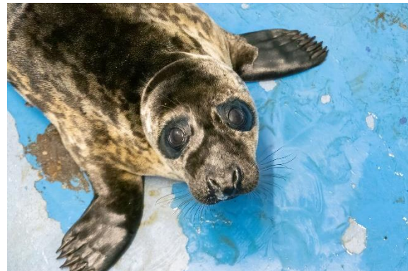
Daniel Craig

I was lucky enough to see Meryl Streep released alongside two other seal pups earlier this month. I hope they all manage to find some fish and safe places to rest.