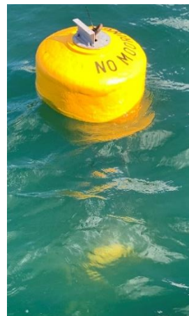
Fig 1 Sterling Mooring Arrangement 1

These buoys demarcate an area for seagrass regeneration where 11 swinging moorings have been removed to reduce the impact of these moorings on the seagrass. Mariners should not anchor or lay gear on the seabed in this area to minimise additional damage to the seagrass.